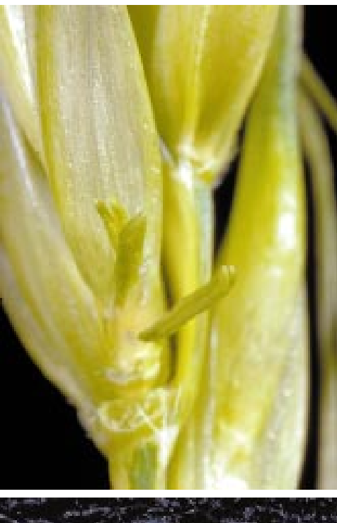
Figure 13: Anthers become twisted and shriveled, yet they are still their normal color within 24 to 48 hours after a freeze. A hand lens is necessary to detect these symptoms.