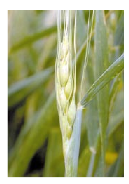
Figure 11: This spike is emerging normally, but the yellow, water soaked appearance, instead of the normal crisp, green spike indicates it is damaged.

Freeze injury at the flowering stage causes either complete or partial sterility and void or partially filled spikes because of the extreme sensitivity.