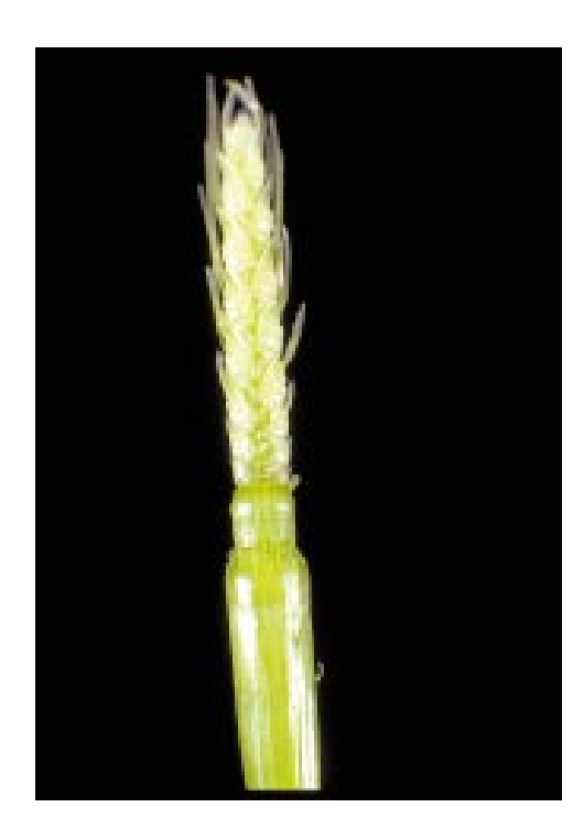
Figure 4: A healthy growing point has a crisp, whitish-green appearance.