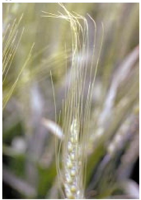
Figure 17: Symptoms of slight freeze damage may occur only on the awns as the spike is emerging from the boot or after heading. Awns become twisted and bleached or white instead of their normal green color. There may be no other damage to the rest of the plant.