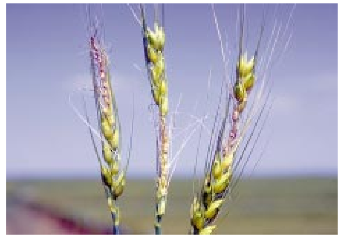
Figure 20: Damage may occur in different areas of the spike because flowering, which is the most sensitive stage to freeze, does not occur at the same time in all florets.

Figure 21: Shortly after pollination healthy kernels begin to develop and are greenish-white.