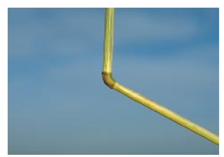
Figure 16: Damage to the lower stem and nodes can occur at the boot and heading stages. Freeze damage causes nodes to become enlarged and the stem to bend or have a crooked appearance.

The germination of grain from freeze-injured plants that is to be used for seed should be checked before planting. Grain of most wheat varieties has a natural dormancy that causes low germination