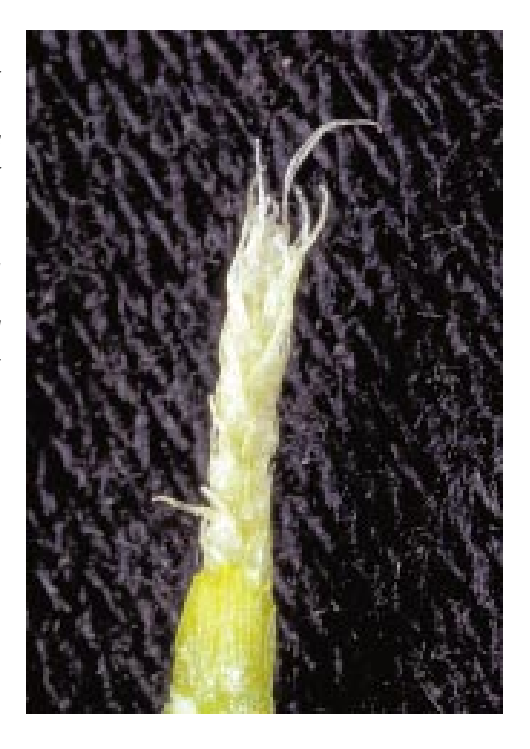
Figure 5: A growing point that has been damaged loses its turgidity and greenish color within several days after a freeze. A hand lens will help detect subtle freeze damage symptoms.

The many factors that influence spring freeze injury to wheat – plant growth stage, plant moisture content, duration of exposure, wind, and precipitation – make it difficult to predict the extent of injury. This is complicated still further by differences in elevation and topography in and between wheat fields. Official weather stations may not reflect true in-field temperatures. It is not unusual, for instance, for wheat growers to report markedly lower temperatures than are recorded at the nearest official weather station.