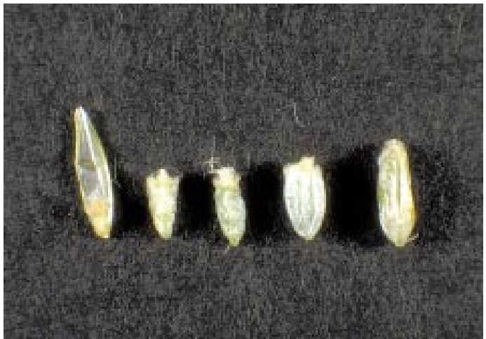
Figure 23: Kernel development stops immediately after freeze damage. Damaged kernels are grayish-white, rough and shriveled.