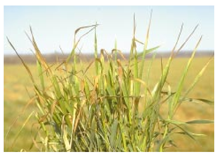
Figure 2: Leaf tip burn and yellowing are common spring freeze symptoms at the tillering stage.

The degree of injury to wheat from spring freezes is influenced by the duration of the low temperatures as well as the low temperature reached. Prolonged exposure to freezing causes much more injury than brief exposure to the same temperature. Temperatures at which injury can be expected, shown in Figure 1 and Table 1, are for two hours of exposure to each temperature. Less injury can be expected from shorter exposure times. Injury might occur at somewhat higher temperatures from longer exposure times.