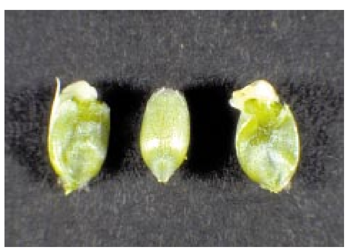
Figure 24: These healthy kernels at the milk to early dough stage contain a whitish fluid. Damaged kernels contain a gray to brownish liquid that is less viscous than the whitish fluid in undamaged kernels.