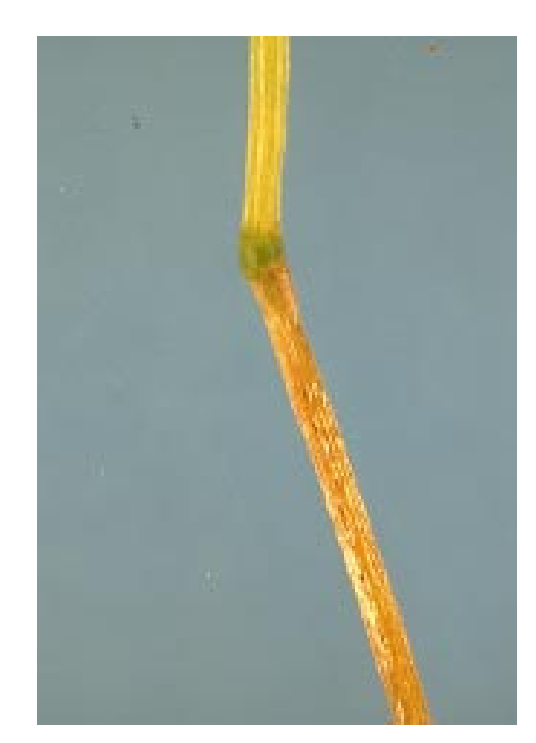
Figure 7: Discoloring and roughening of the lower stem are symptoms of spring freeze damage.

Mild stem injury does not appear to interfere with ability of wheat plants to take up nutrients from the soil and translocate them to the developing grain. Microorganisms might infect injured