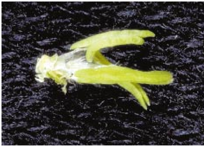
Figure 14: Close-up of twisted anthers and unopened whitish stigma shown in Figure 13.

Figure 15: If damaged, anthers become white after 3 to 5 days and eventually turn whitish-brown. The anthers will not shed pollen or extrude from the florets.