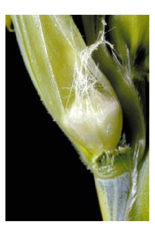
Figure 21: Shortly after pollination healthy kernels begin to develop and are greenish-white.

for several weeks after harvest. The grain should be given a cold treatment before testing, or germination tests should be delayed for about four weeks after harvest. If germination is slow and germination percentage is low four weeks or more after harvest, the wheat should not be used as seed. Shriveled seed should not be used in any case because field emergence is poor even if germination percentage is high. In addition, shriveled seeds produce less vigorous seedlings that usually yield less grain than seedlings from good quality wheat seed.