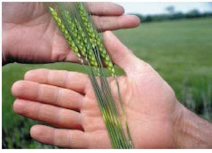
Figure 19: A whitish frost ring encircles the stem at the juncture of the stem and flag leaf at the time of the freeze.