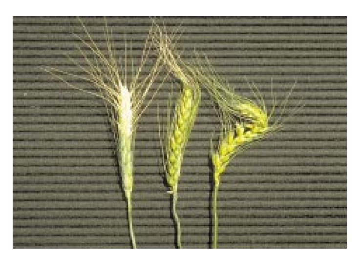
Figure 10: The twisted spike on the right was trapped in the boot and split out the side of the sheath. The awns of the middle spike were damaged while it was still in the boot stage. The spike on the left had partially emerged when freezing occurred so only the upper portion of the spike was damaged.

areas causing further stem deterioration. Lodging, or falling over, of plants is the most serious problem following stem injury. Wind or hard rain will lodge the plants easily, slowing harvest and decreasing grain yields. With severe stem injury, splitting of stems and collapse of internodes is common (Figures 8 and 9). The growing point does not appear damaged immediately after a freeze. It will become dry and off-white to brown if the stem is damaged. Also, the growing point will not move upward. The loss of these early tillers releases the later tillers that would not normally develop because of too much competition.