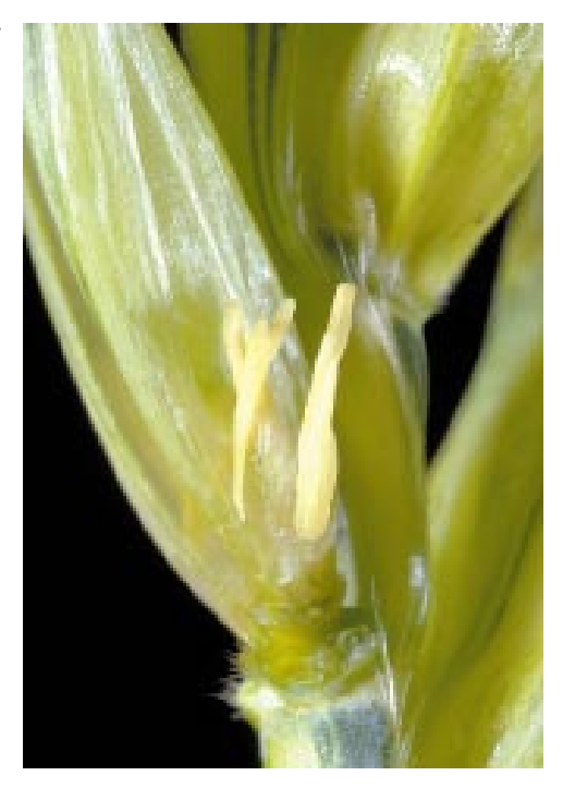
Figure 15: If damaged, anthers become white after 3 to 5 days and eventually turn whitish-brown. The anthers will not shed pollen or extrude from the florets.

Flowering proceeds from florets near the center of wheat spikes to florets at the top and bottom of the spikes over a 2- to 4-day period. This small difference in flowering stage when freezing occurs produces effects shown in Figure 20. The center or one or both ends of the spikes might be void of grain because those florets were at a sensitive stage when they were frozen. Grain might develop in other parts of the spikes, however, because flowering had not started or was already completed in those florets when the freeze occurred.