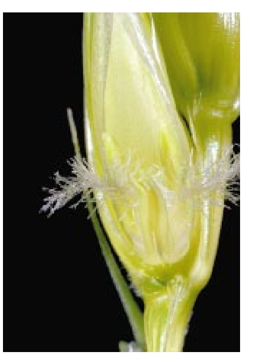
Figure 12: Healthy wheat anthers are trilobed, light green and turgid before pollen is shed. Each wheat floret contains three anthers. Healthy stigmas are white and have a feathery appearance.

Figure 11: This spike is emerging normally, but the yellow, water soaked appearance, instead of the normal crisp, green spike indicates it is damaged.