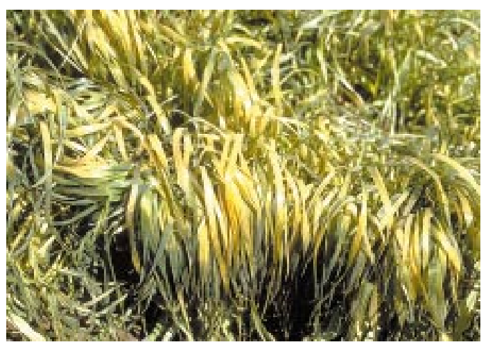
Figure 3: More severe freeze damage causes the entire leaf to turn yellowish-white and the plants to be flaccid. A silage odor may be detected after several days.