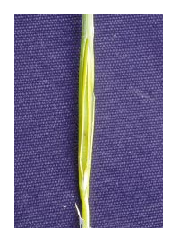
Figure 8: Splitting of stems occurs with severe freeze damage.

Figure 7: Discoloring and roughening of the lower stem are symptoms of spring freeze damage.