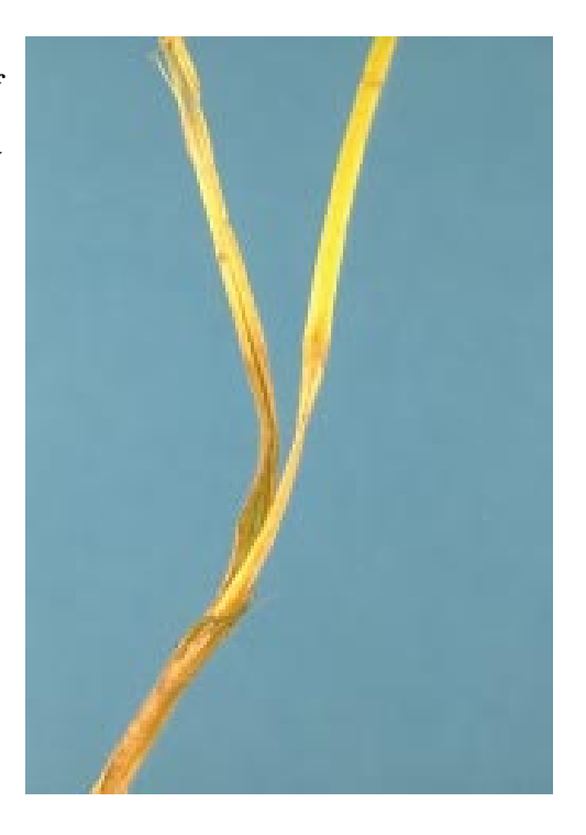
Figure 9: Collapse of internodes, which may lead to lodging, occurs with severe freeze damage.