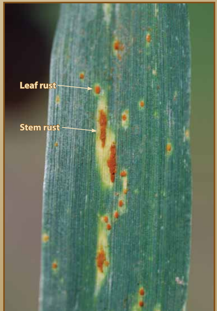
Figure 2. Comparison of the stem rust and leaf rust lesions on leaf tissue. Note the larger diamond shape of the stem rust relative to leaf rust.

Differentiating the rust diseases can be difficult, but with practice they can be reliably identified. Begin by considering broad characteristics such as which plant parts are affected (Figure 1) or arrangement of the blister-like lesions on plants. These characteristics will often separate one or more of these diseases quickly. Continue by examining less obvious characteristics including lesion size, shape, and color to either confirm the diagnosis or separate the more similar diseases. For example, stripe rust is the only one of these diseases to have the blister-like lesions organized into stripes on the leaves (left). If the lesions are scattered on the affected plant parts, both stem rust and leaf rust are a possibility and additional characteristics must be considered. Leaf rust typically causes small, round lesions on the leaf blades and leaf sheaths. In comparison, stem rust causes oval or elongated lesions and is capable of infecting nearly all aboveground parts of the plant, most notably the true stems (Figure 2).