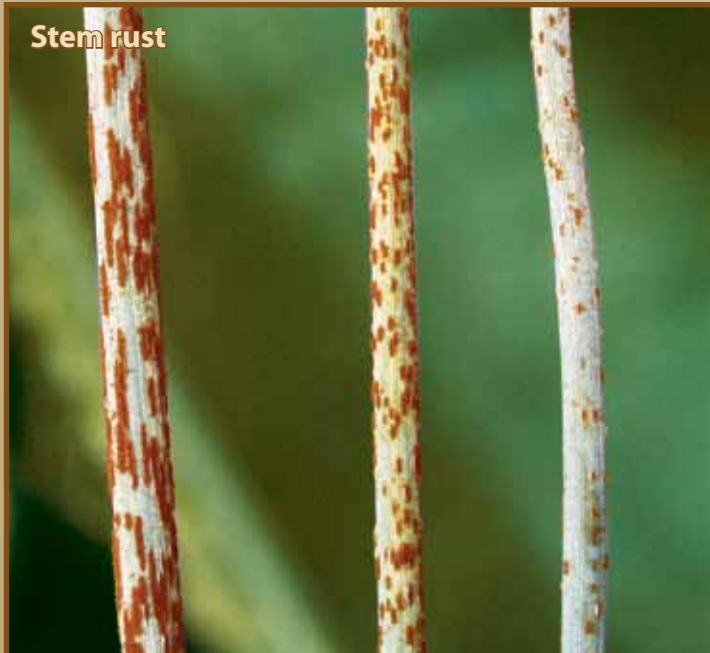
Figure 3. Examples of the variability in symptoms caused by stem rust (below), leaf rust (upper right) and stripe rust (lower right) as a result of unique interactions with wheat or barley varieties.

All three diseases have unique interactions with common varieties of wheat and barley. These interactions can modify the disease symptoms resulting in reduced lesion size and varying amounts of yellow or tan tissue surrounding the lesions (Figure 3). Becoming familiar with the range of possible symptoms for these diseases will improve the accuracy of the diagnosis and the management of these economically important diseases.