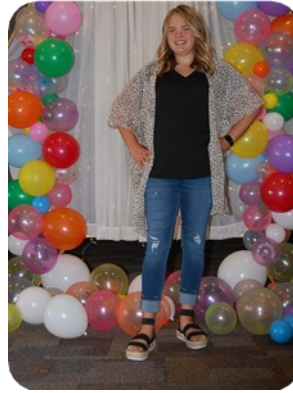
Shopping and Style Clothing

Good news! Only 50% of the outfit needs to be constructed.